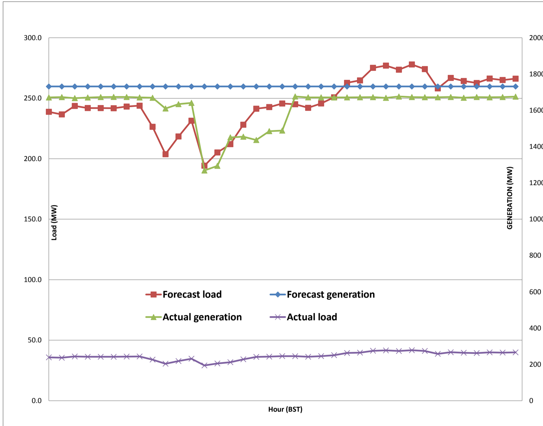
Forecast Generation & Load with Actual Generation & Load of Today from 00:00hrs to 09:00hrs(26-Aug-2017).